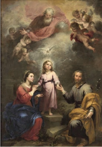
Bartolome Murillo, The Two Trinities Spanish, 1675-1682 London, National Gallery of Art

St. Joseph, with Mary and Jesus, forms a sort of terrestrial trinity represented by the familiar formula: Jesus, Mary and Joseph.